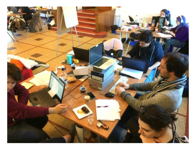
Figure 1.2 – The Scientific Game Jam hosted by the University of Bordeaux brought multidisciplinary teams of students to innovate games that raise awareness of a certain scientific topic and/or collect scientific data (e.g. a platform for citizen science). Teams were composed of at least one game designer, one graphic designer, one programmer, one sound designer and one scientist. The game centred around the research themes of the team's doctoral student, which included sociology, environmental science and virology.

Figure 1.1 – The Fablab Coh@bit at the University of Bordeaux is a space to collaborate, create and prototype innovative products. Facilities include 3D printing, Arduino (open source electronics hardware and software), and laser engraving. The fablab hosts activities for university students, young school students, private companies and the general public.