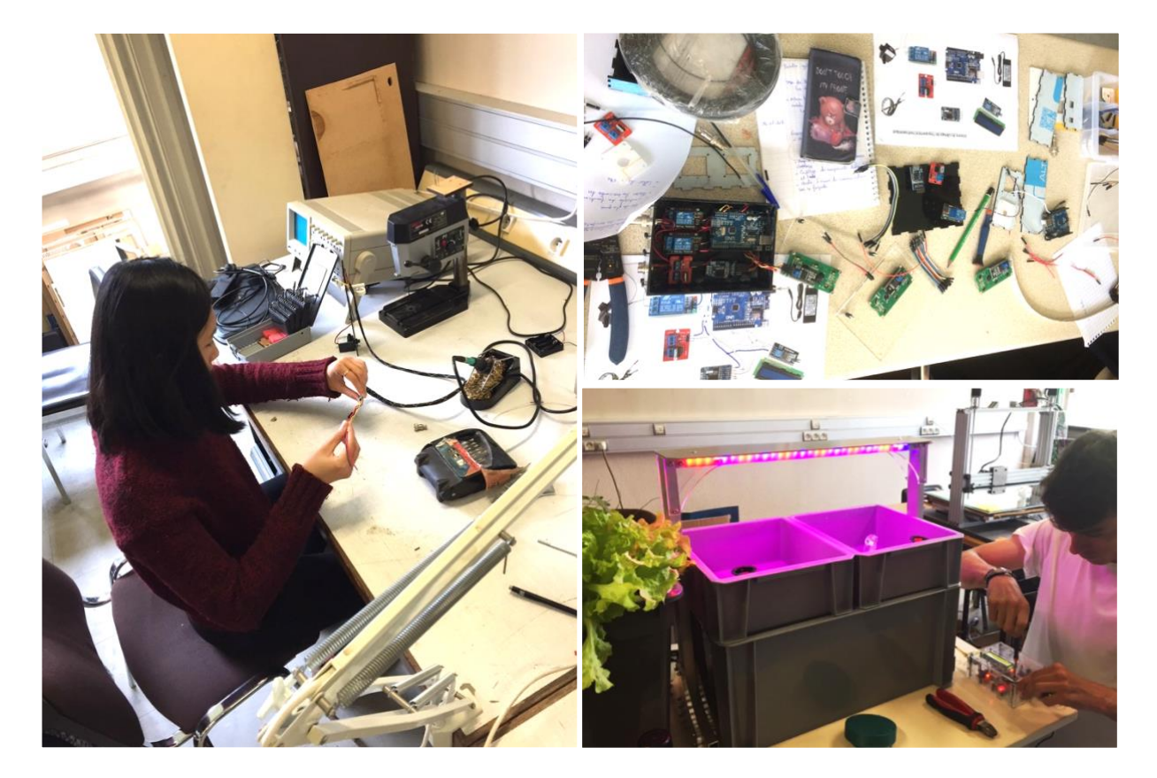
Figure 1.1 – The Fablab Coh@bit at the University of Bordeaux is a space to collaborate, create and prototype innovative products. Facilities include 3D printing, Arduino (open source electronics hardware and software), and laser engraving. The fablab hosts activities for university students, young school students, private companies and the general public.

Integrating Open & Citizen Science into Active Learning Approaches in Higher Education