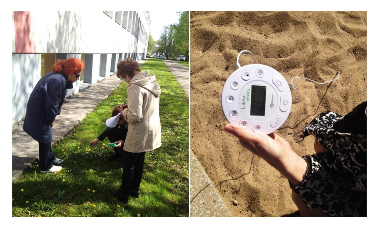
Figure 1.3 – A citizen science activity hosted by Tallinn University. School teachers test out an environmental sensor (by <u>Labdisc Enviro</u>). These sensors are to be used by school students to measure the urban heat island effect of the city.