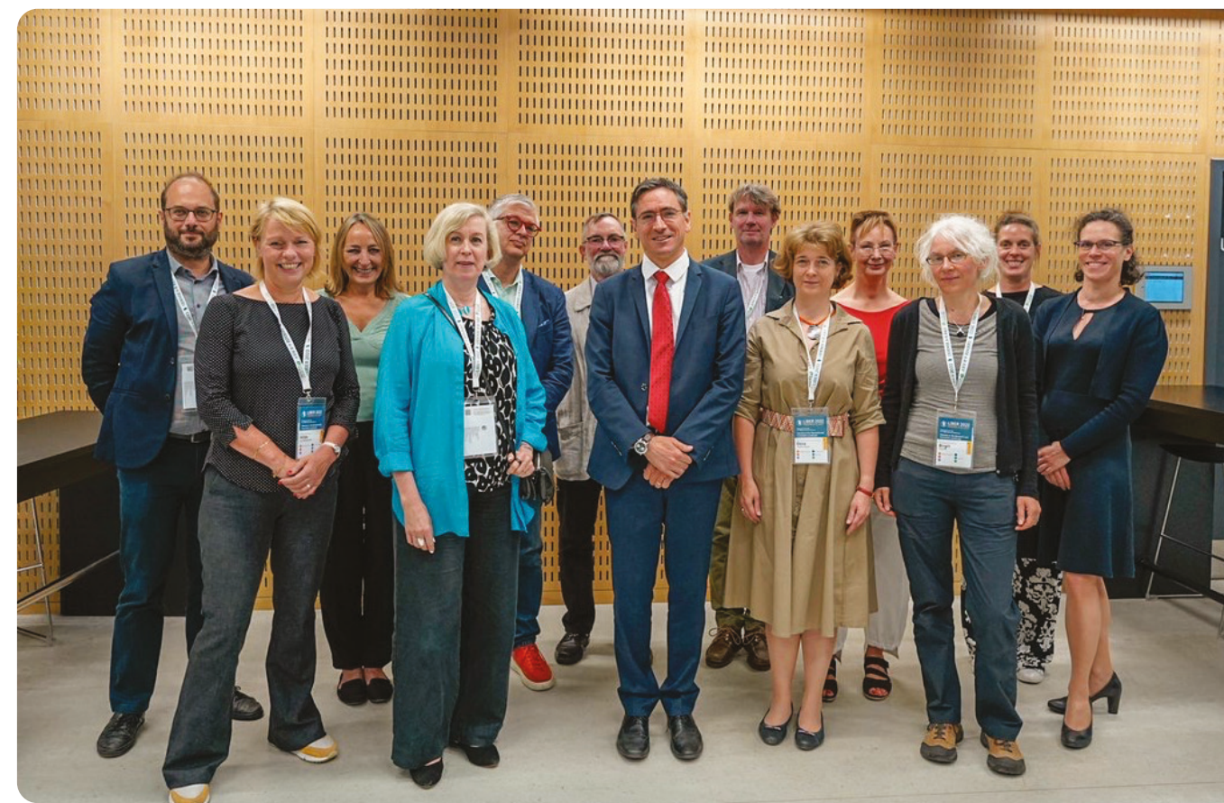
The current LIBER Executive Board at the 2022 Annual Conference in Odense, Denmark