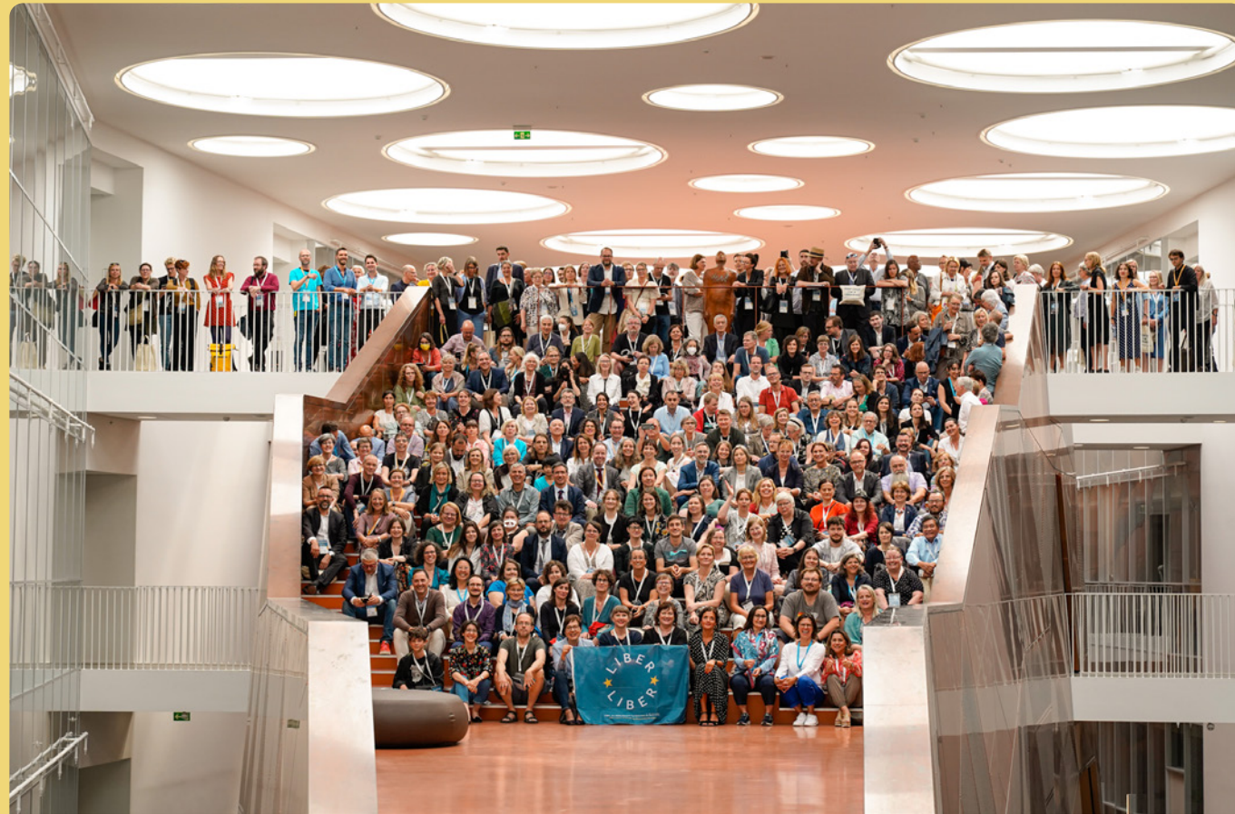
Delegates at the LIBER Annual Conference 2022 in Odense, Denmark

The 2022 Annual Conference was hosted by the University of Southern Denmark (SDU) Library in Odense, Denmark. After two-years of online conferencing, the event was sold out. Everyone was delighted to see each other again in Odense. What a difference it made in networking, conversations, and overall activities. Thanks to the friendly staff – a cooperation between SDU and LIBER – the participants appreciated a smooth organisation and atmosphere.