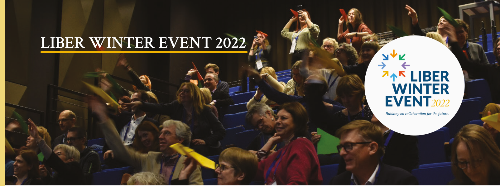
Participants at a feedback session at the LIBER Winter Event 2022

LIBER's first Winter Event was held at VU Amsterdam, on 1-2 December 2022. Around 100 attendees from our member libraries and project partners all over Europe came together to discuss the most important topics for research libraries.