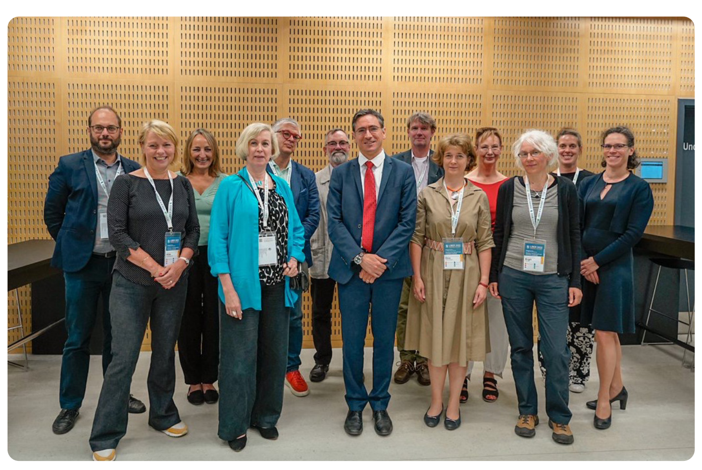
The LIBER Executive Board at the 2022 Annual Conference in Odense, Denmark