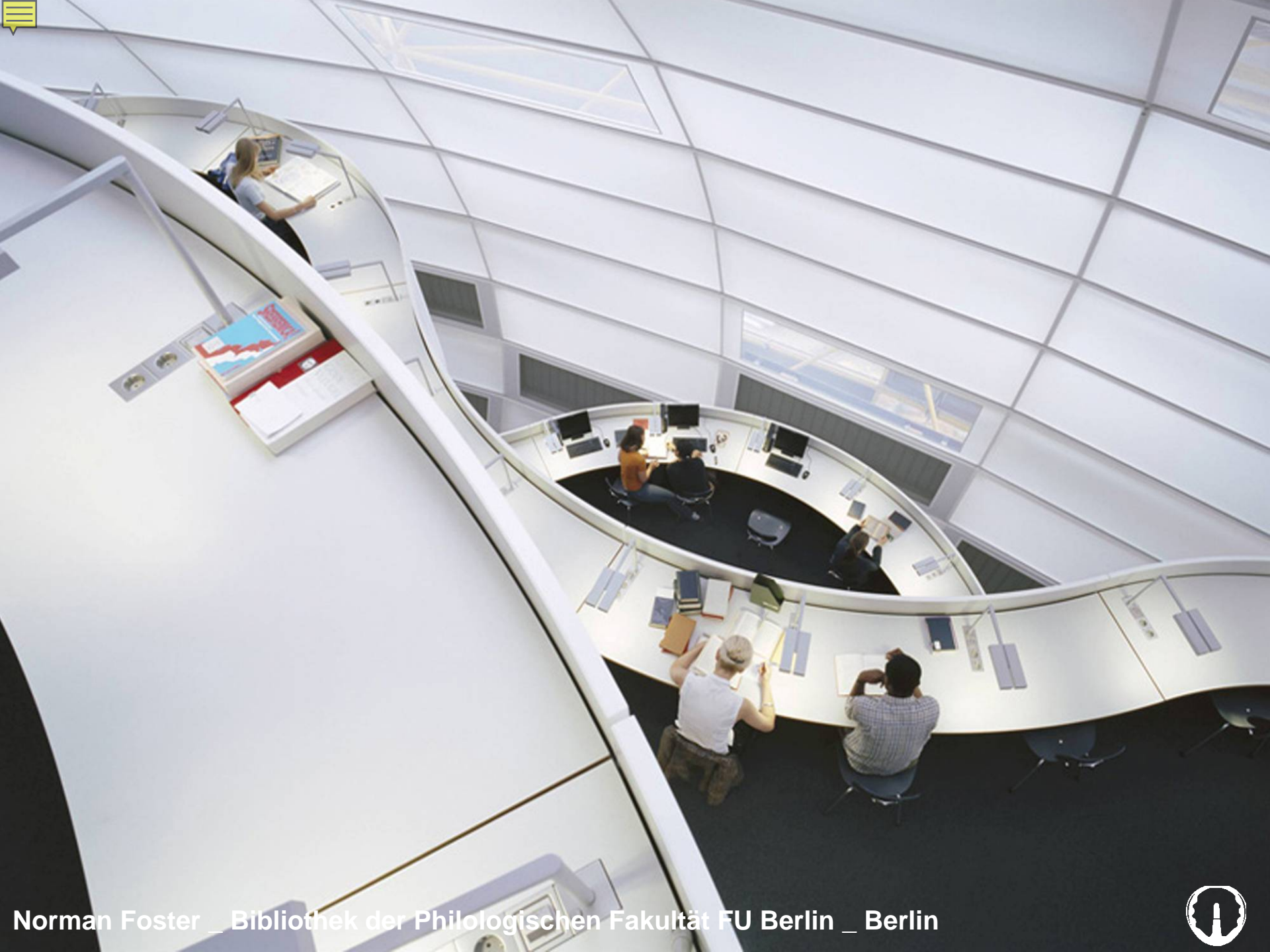
Norman Foster _ Bibliothek der Philologischen Fakultät FU Berlin _ Berlin