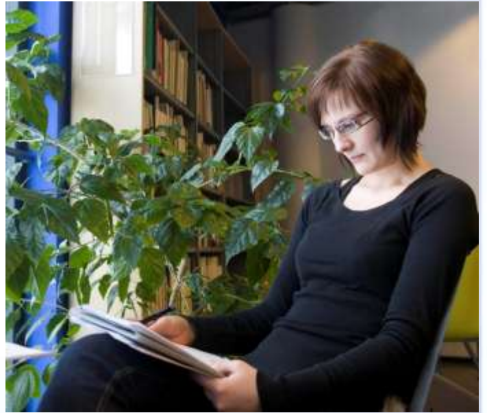
UNIVERSITY OF HELSINKI